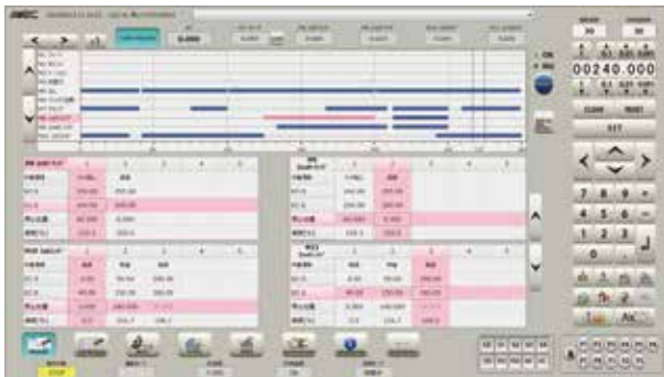
MPS main program screen

Gives a comprehensive view of what is happening with the spring machine, allowing easy checking and adjustment of the specification pattern program and at-a-glance view of multiple axes' statistics.